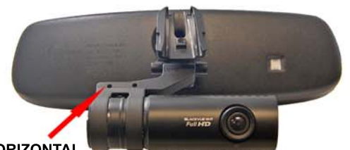
SPRING CLIP HORIZONTAL ADJUSTMENT SCREW

3 - Using the upper and lower pivot screws, adjust the mount to achieve your desired location of the dashcam. We recommend adjusting it as high as you can. You can also use the spring clip horizontal adjustment screw to help center the dashcam with the mirror as shown above.